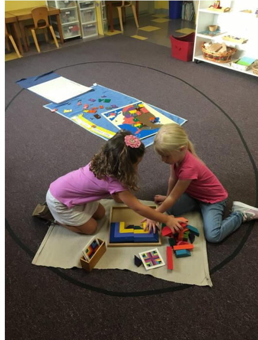
Whitley and Mila working on the pattern puzzle