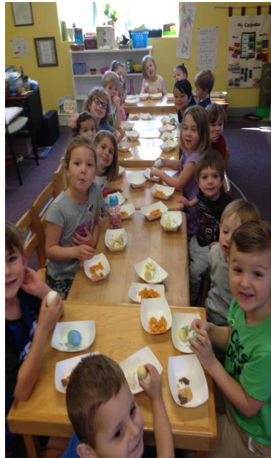
Easter Celebration snack together. Eating the dyed eggs they made and bunny crackers. I did not tell them to make silly faces. They just naturally did that.