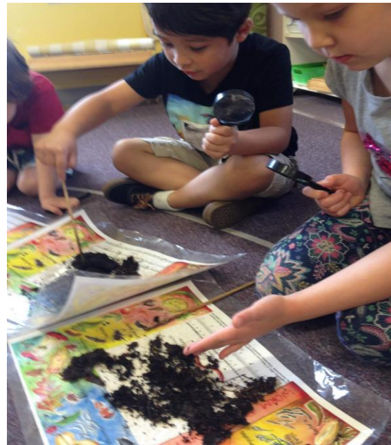
Looking through the compost for insects, our new classroom pets. We now can compost our food scraps and shrink our garbage even more.

This lesson has many steps and takes lots of concentration. ]