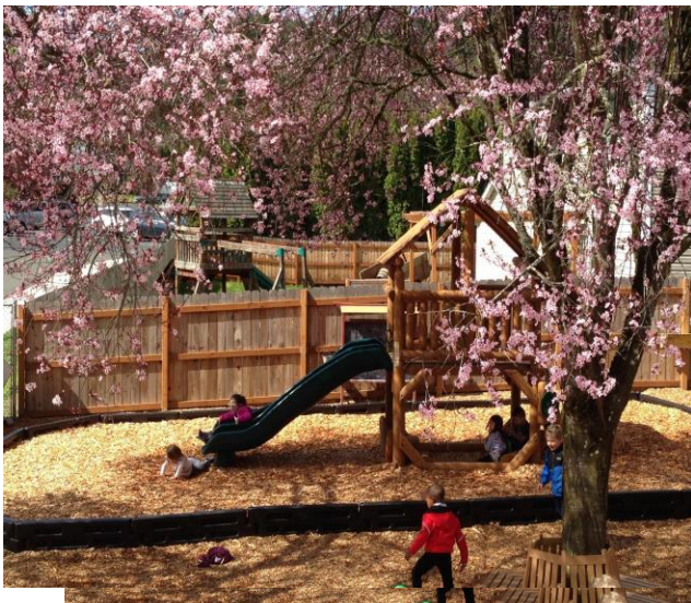
Blossoming trees in the play yard. The children are enjoying the new play structure.

Spring is in the air for the Dragonfly Room...blooming tulips in the yard, birds singing outside our window and the warmer weather. We have been observing and learning about the metamorphosis of ladybug larvae and caterpillars, now in the chrysalis stage. We planted a variety of vegetable seeds and watched them sprout in the classroom. Then transplanted them to the backyard garden where they will be cared for by the children. Bird viewing has been a popular interest as well. We have had a lot of activity at the feeder and the children are identifying them using the bird book. Earlier in the month we had a Young Audience show called Sisbro. The children experienced a life size whale shark as well as learning a lot about underwater marine life. We also got new pet red worms from Penny's mom. We will be feeding them our food scraps which they will break down the food and paper creating a beneficial compost for our garden. Each child got a pile of dirt loaded with insects and worms to dig through and examine. Below is more about what the individual children have been working on.